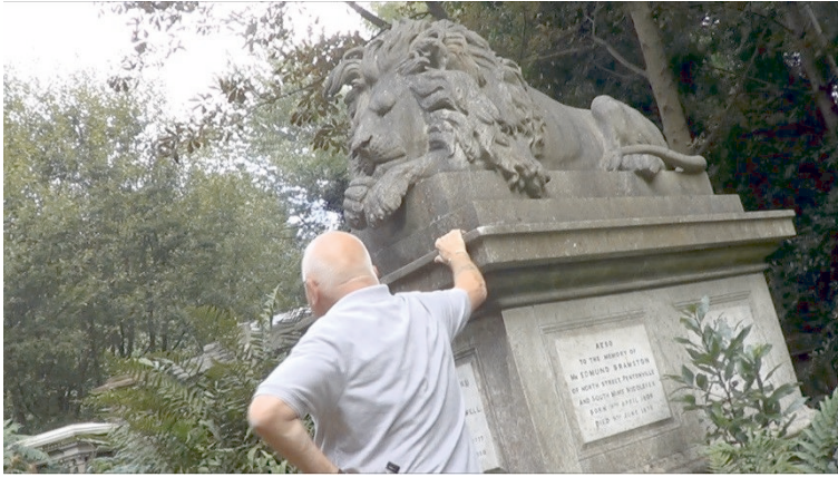
Fig. 10: The tombstone of George Wombwell with the lion Nero sleeping on the top of a sarcophagus.

they are often not directly connected to the materiality of the cemetery and could also be told on another occasion at a different place. In this way the narratives enlarge the cemetery's geographical space with the life stories of the people buried there. These stories are complemented with personal stories of the tour guide. For example in front of the grave of a person who recently passed away, Alexander Walterowitsch Litwinenko, member of the KGB, he mentions: «...they put some radioactive stuff into his tea, uhm, a lot of people say, was he safely buried here? He is, because it was a substitute of Pollonium 210...» 41 The TG tells his personal story about an Arsenal football game he attended where they had to close a whole section of the football stadium. The deceased was at a game in the same stadium before he died and according to the TG they feared «some radioactive stuff» in this section. By sharing these personal stories the TG connects successfully with the Ps.