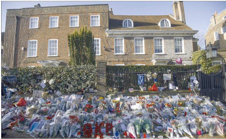
Fig. 1: A place for mourning in front of George Michael's house in Camden, London. 5

The example of George Michael's grave shows how the Trust regulates the cemetery's practices and usages. Obviously there is a private part in West Highgate that is not open to the public. The relatives' wishes may have formed part of the decision to make the grave non-accessible for visitors. But in addition the Friends of Highgate probably feared West Highgate Cemetery might become swamped by mourning fans, by their tributes and ultimately turning it into a place of mass pilgrimage as is the case with other tombs in East Highgate notably the grave of Karl Marx. 4 The Trust argues that there is not enough space to receive the tributes, which, on the one hand, is a little surprising given the spatial dimensions of the cemetery. On the other hand, however, the policy might be deemed reasonable remembering the pictures in the press of the huge piles of flowers, letters, candles and pictures among other things in front of George Michael's house in Camden (fig. 1).