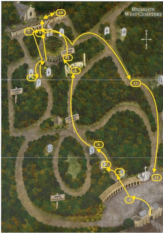
Fig. 8: The map is pictured on the back of the flyer that is distributed at the entrance to the cemetery (Image: Marie-Therese Mäder 2017).

The applied method of gathering data in the field and later interpreting it evaluates how the tour shapes the reception of the cemetery. The data is analysed by a combination of two approaches namely sociological hermeneutics of knowledge and grounded theory. 26 The analysing process has been adapted to the collected data of the field notes and is divided into three steps. 27 In the first step the audio recording has been transcribed. Next the transcribed text has been extended with the photographs namely the photos have been assigned to the text so that text and images are synchronized in space and time. Finally, the text has been divided into different kind of actions accomplished by the TG and the Ps. This included ver-