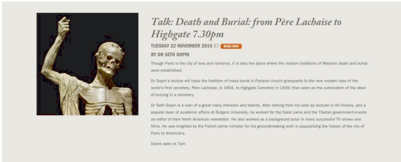
Fig. 5: The memento mori figure is not immediately connected to the topic but is at least a catchy subject.